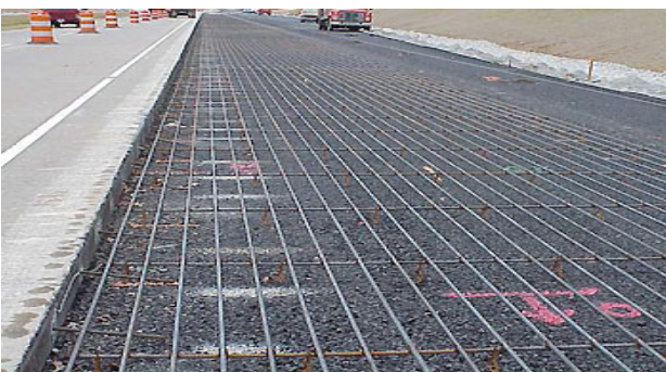
Reinforced concrete structures