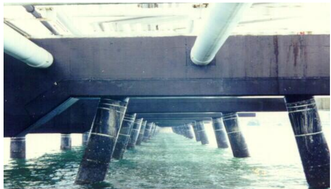
Marine metallic structures