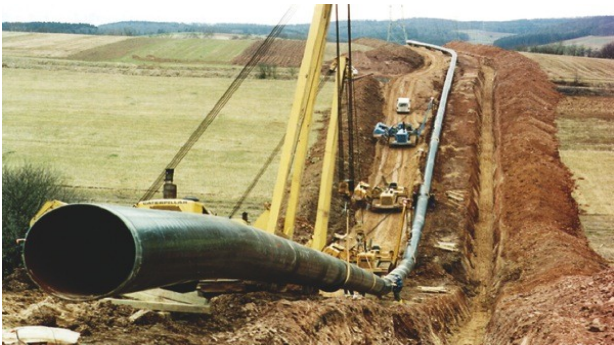
On land metallic structures

Including Training, Examination, Competence and Experience Assessment and Certification