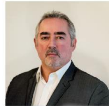
AHI Branch Vice Chair