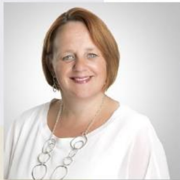
AHI Branch Chair