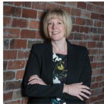
AHI Branch Manager